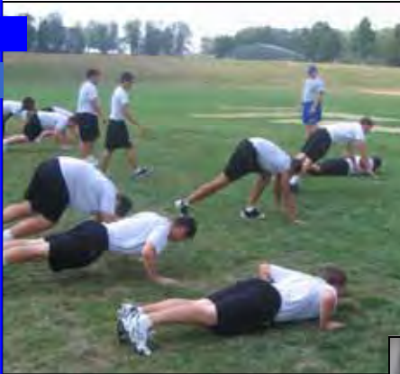
Left: Students involved in the football mini sports camp endure an exhausting workout.